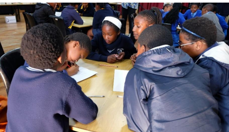
The Grahamstown Adventist Primary School team digs deep for answers.

The quiz was a huge success, allowing learners to compete for literary glory in a convivial and joyful environment.