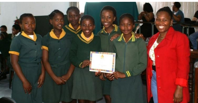
Second place was tied between Ithuba Wild Coast Community College (above) and Insingizi Primary School (right)