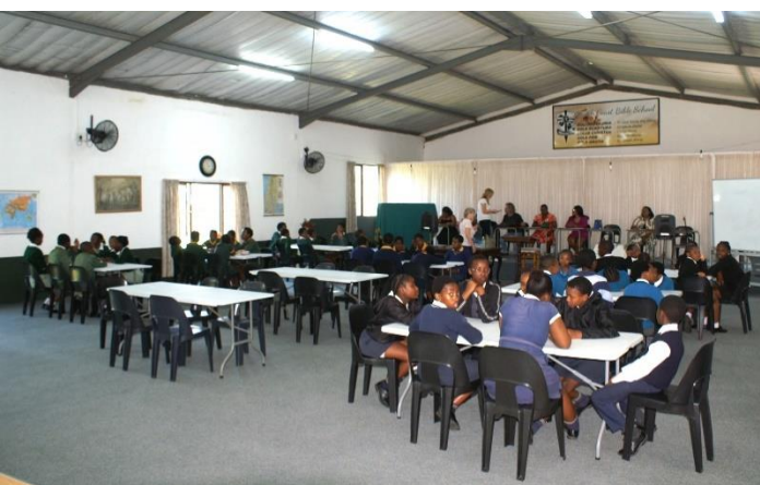
The quiz was held in a wonderful venue near Gcilima - the photo shows part of the venue. The two empty tables were for the missing schools.