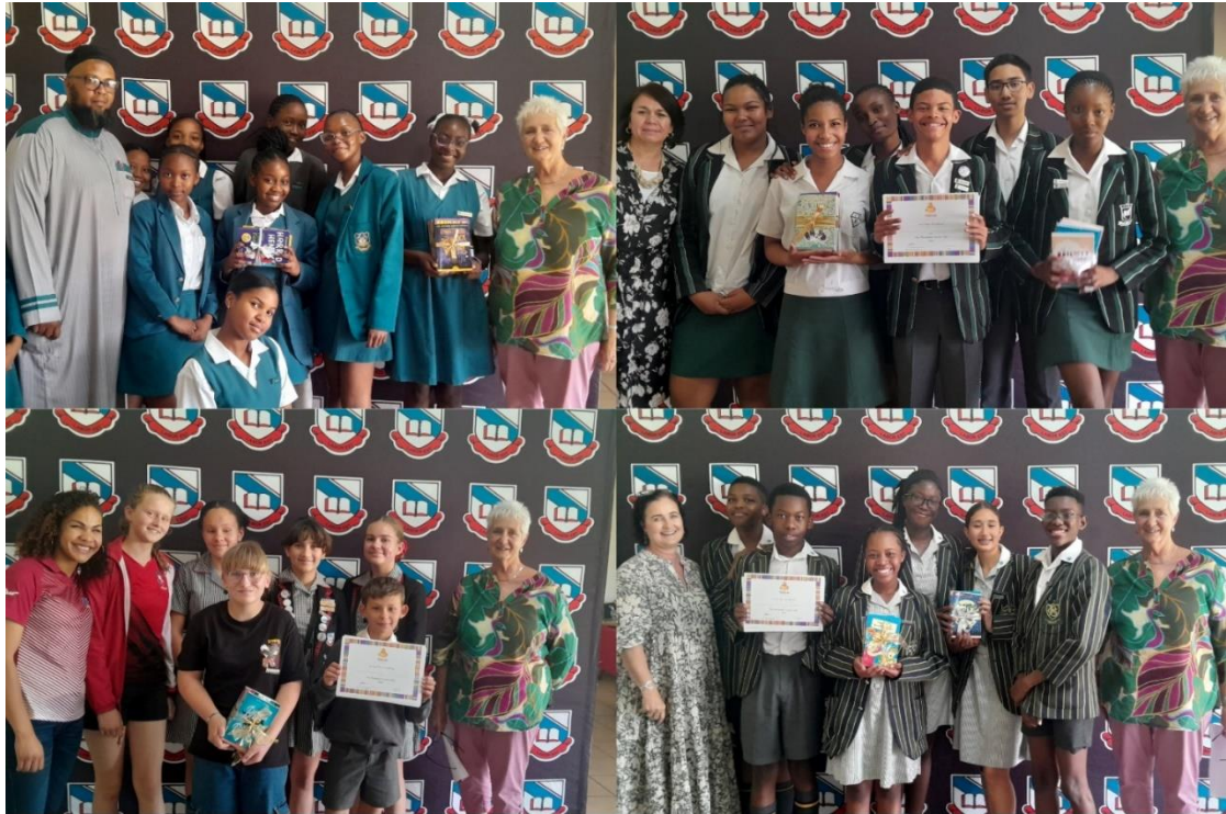
Enthusiastic teams from Kimberley's first Phendulani Quiz

Learners today do not have adequate exposure to reading or books, as a result of economic conditions but also the changing nature of how children are being raised. Learners are prone to choosing electronic devices over paperback books, or programs on their computers over graphic novels and animated films over story books. But it is our responsibility as educators to foster a love of literature within them.