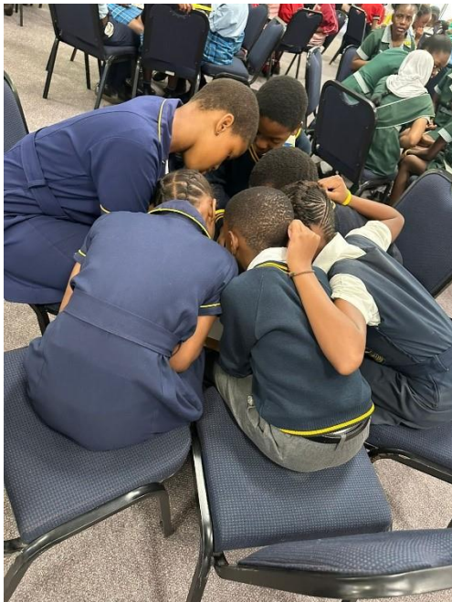
A team discussing the answer

Each participating school won a gift box filled with a selection of new books for their library and the top four schools won extra books for their libraries.