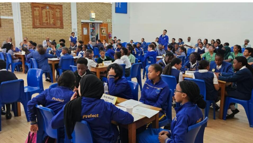
Phendulani Cape Town participants at Muizenberg Junior School

In October, I ran the Cape Town Phendulani Quiz at Muizenberg Junior School. As the answers to the questions were read out for each round, the excitement in the room was indicative of the engagement the learners had with the books. I am reminded that many of these children may not own books and rely on their schools to expose them to whatever books are available. During the quiz, 42 books were handed out to learners as prizes, and to participate the learners read 12 good books. In answer to the question on the evaluation form, “How can the quiz be improved?” The answer is often “more books!”.