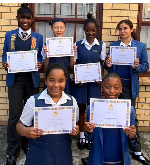
The winners from Muizenberg Junior School