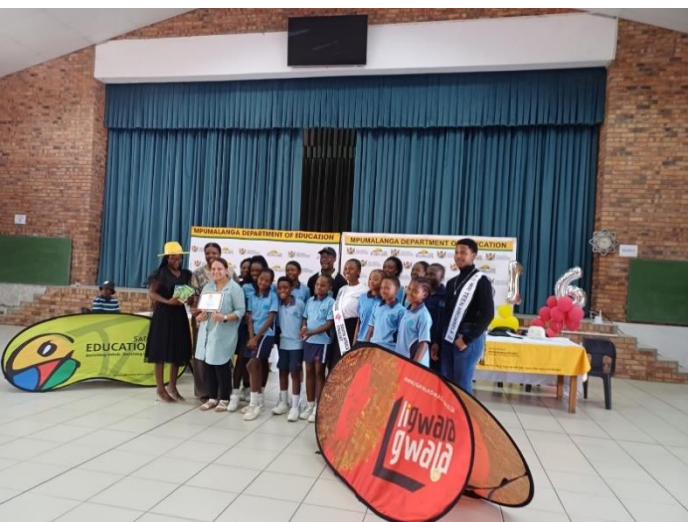
The winning team from Thekwane