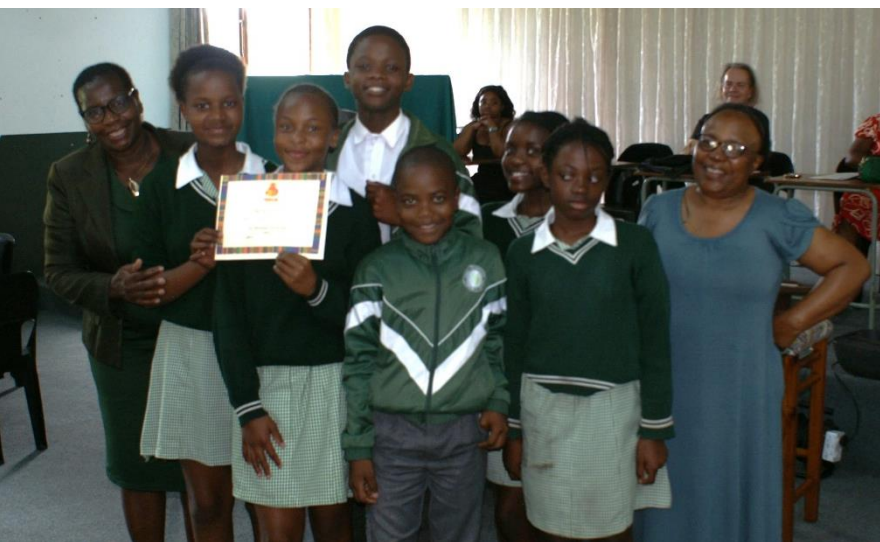
Winners of Phendulani Quiz in Margate: Isikhuthali Primary School

As always, the Phendulani Quiz was a huge success this year. Initially we had 9 schools participating but unfortunately 2 had to withdraw at the last minute due to internal school issues.