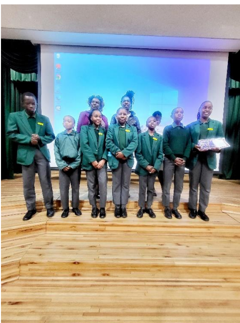
The winners from Nokhuphila Primary School.

The Kyalami School Group actively promotes a reading culture across six schools: Modern Primary, MC Wieler Primary, Olivenhoutbosch, Nooitgedacht, Noordewyk Primary, and Nokuphila Primary School.