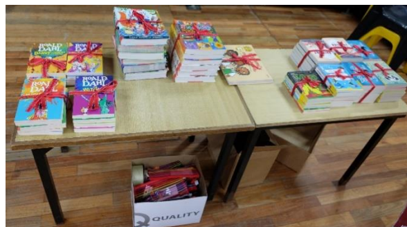
Some of the book prizes on offer at the Phendulani Literary Quiz in Makhanda.