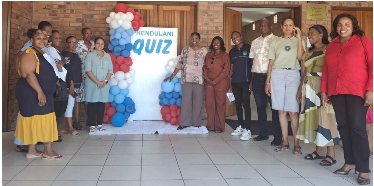
Coordinators for the Phendulani Quiz in Bombela