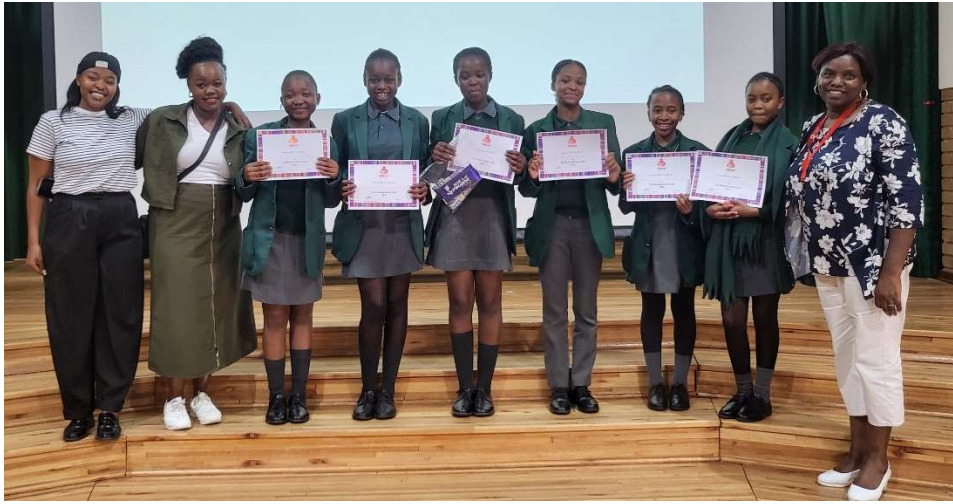
Nokuphila 2 in second place