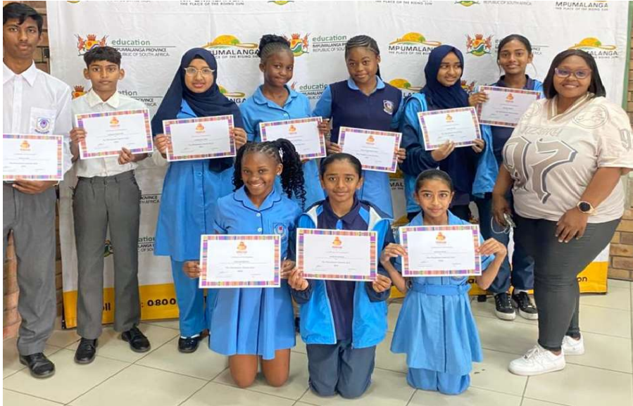
In second position was Valencia Combined School