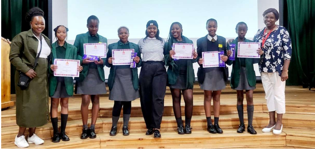
Nokuphila 1 in first place