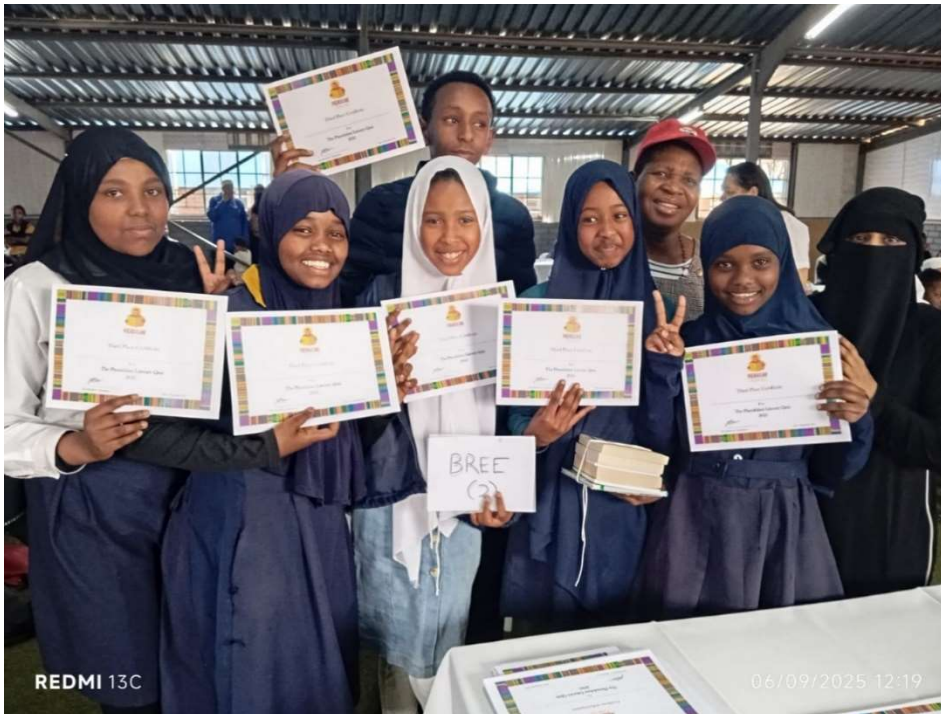
Bree Primary School took 3rd position

Equally exciting was the tie between Newclare Primary and Bree Primary school. Only the second time that Bree participated in the quiz. A sudden death playoff question was won by Newclare Primary with Bree taking the third position. This was a good indication of the high level of the competition. Newclare Primary, who won the competition for three years in a row, losing out on the first position and been challenged for the second position by Bree Primary.