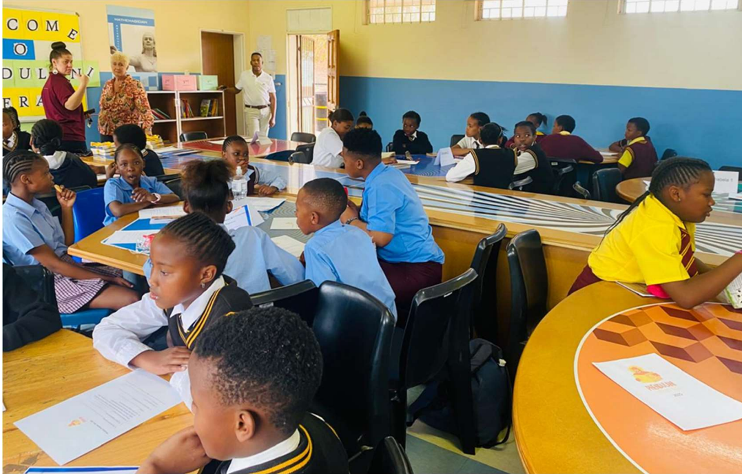
Gonyane Primary School hosted a pilot Phendulani Quiz in Bloemfontein