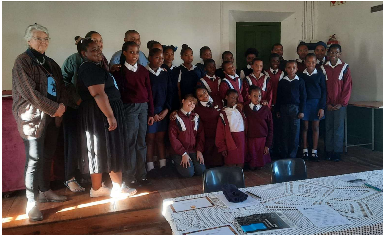
Certificates and book prizes were handed to the three winning teams in Stanford

Total scores for the whole quiz were then tallied up, and the winning teams were announced.