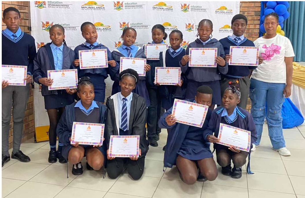
Entabamhlope Primary School