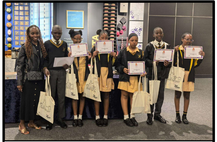
Second place went to Impala Crescent 1