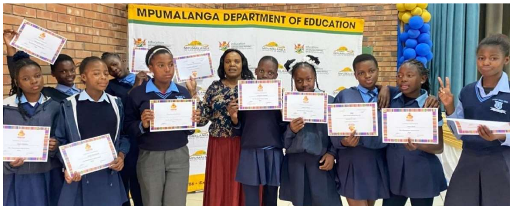
Boschrand Primary School