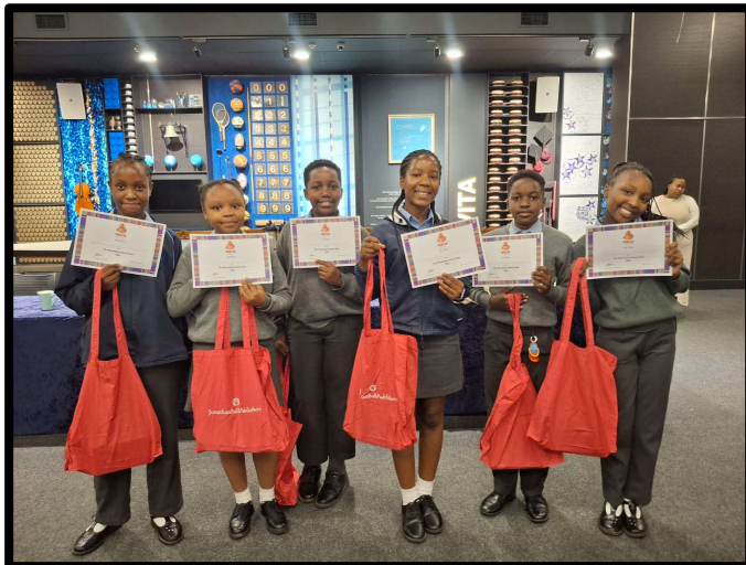
Vuleka 1 took third place in the Johannesburg round