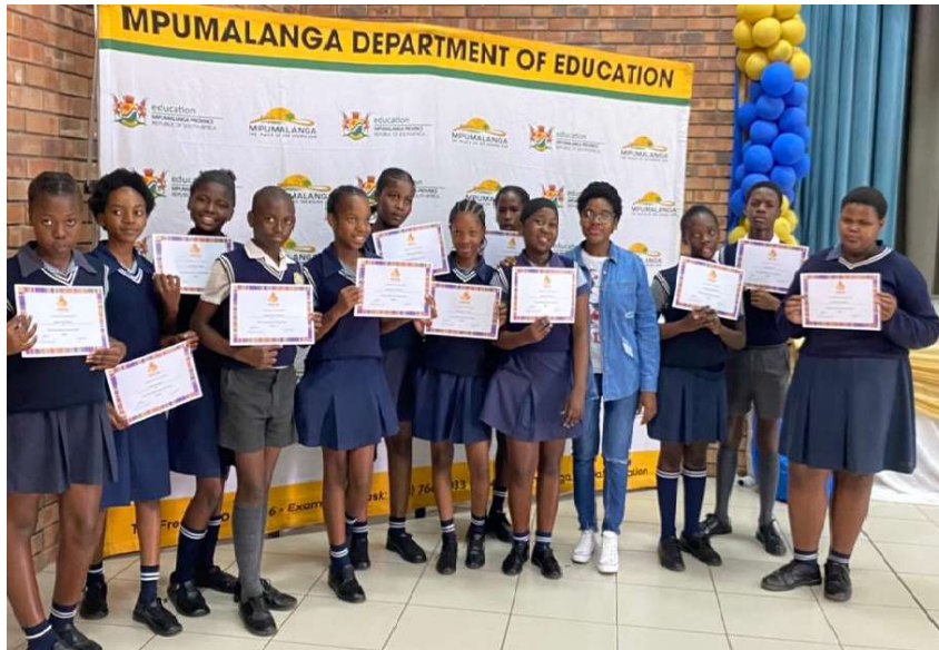
2025 Third Position John Mdluli Primary School