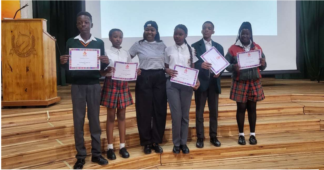
Nooitgedacht Primary 1 secured third place