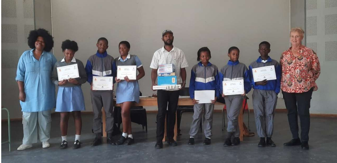
Dalubuhle Primary took second place in Franschhoek