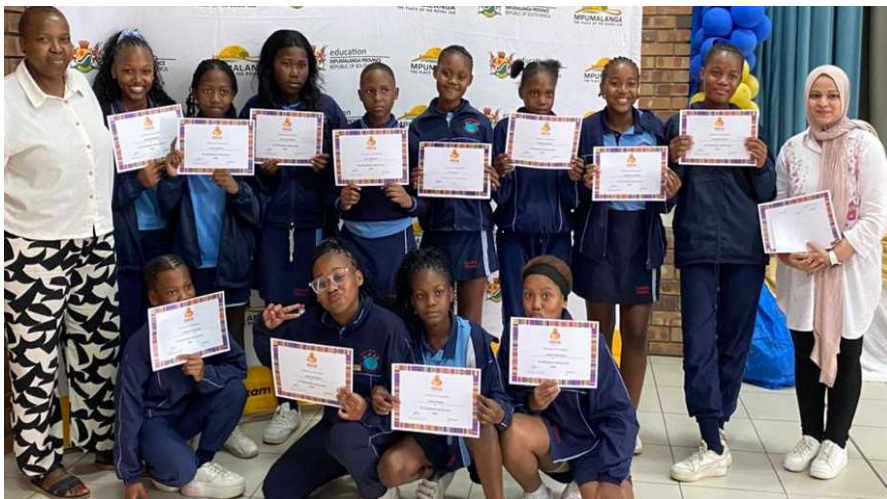
2025 Phendulani Quiz winners Thekwane South Primary School

The 2025 winning team was from Thekwane South, with second place going to Valencia Combined School and third place to John Mdluli Primary School.