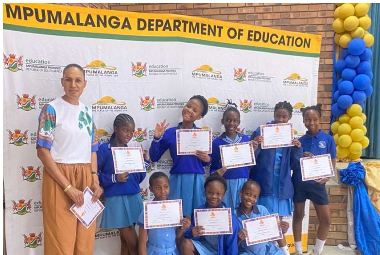
2025 Participants Nellsville Combined School